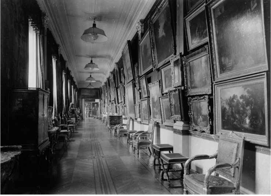
Fig. 1. The picture gallery in the Arenberg Palace, Brussels ( photograph, ca. 1903/04, Enghien )

only very few of the artworks adorning the Brussels Arenberg palace in the nineteenth century originated from the old family property, as much of the original art collection had been destroyed by fire in 1695.