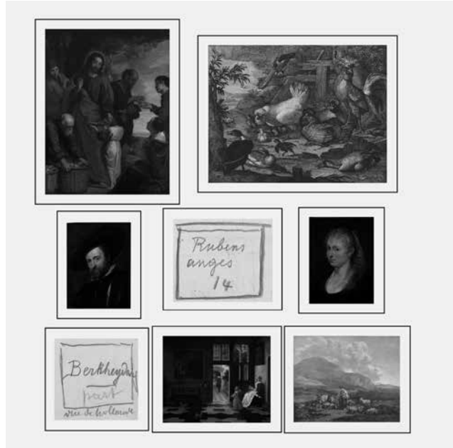
Fig. 3. Virtual reconstruction of the panneau VI featuring two of the masterpieces of the collection, Rubens' Self-portrait and his Portrait of a young woman with curly hair