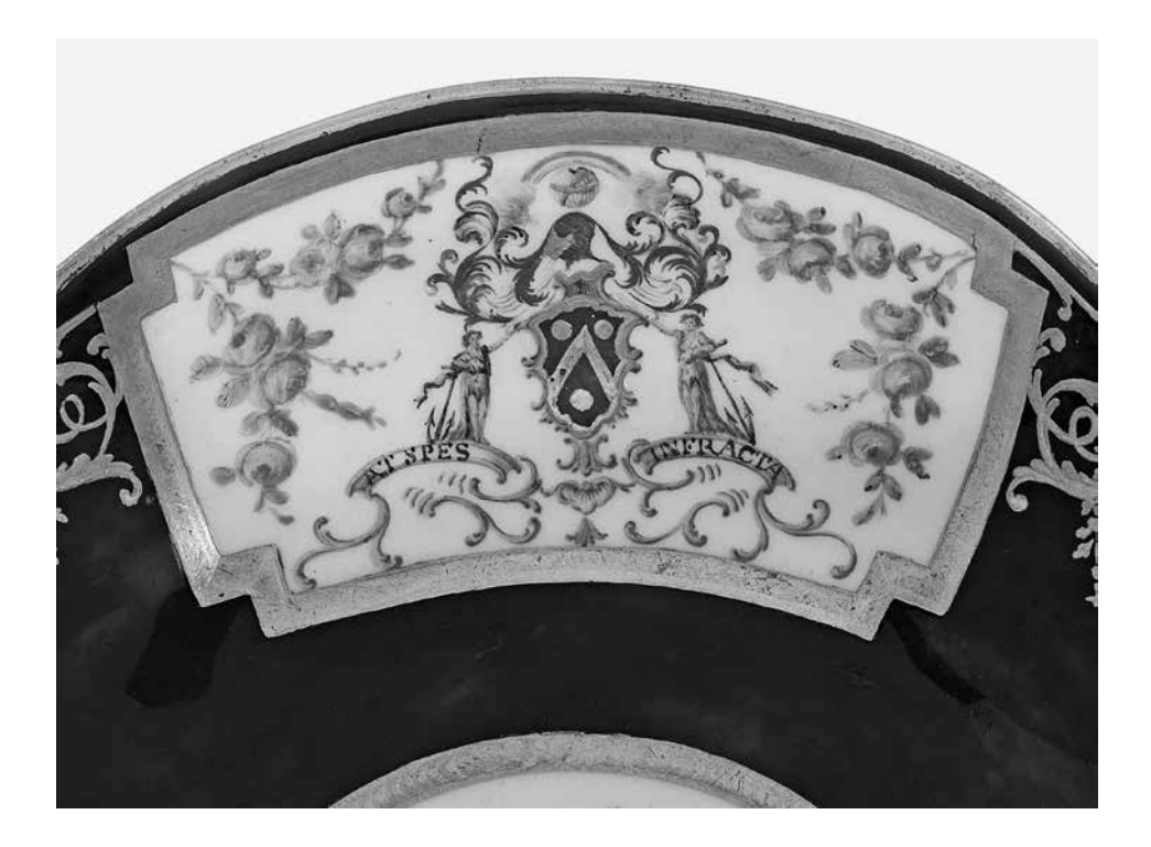
Fig. 2. Detail of a piece from a service decorated with garlands, baskets of flowers and grisaille cameos after the antique against a beau bleu background. It incorporates the coat of arms of the Scottish Hope clan, as well as their motto motto At Spes Infracta (private coll.)