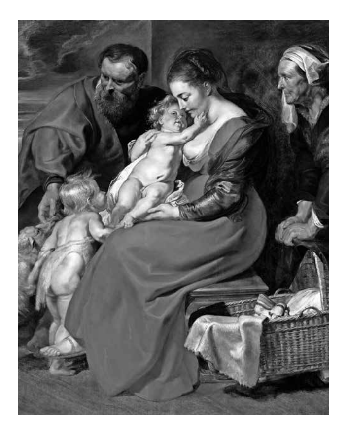
Fig. 1. The Holy Family with Saints Elizabeth and John the Baptist (oil on panel, Peter Paul Rubens, circa 1615; coll. Art Institute of Chicago)

instance Clodion's Offering to Priapus of 1775 in the J.P. Getty Museum, two Limoges enamel plaques depicting the story of Aeneas in the Walters Art Museum, Murillo's Holy Family with the Infant Baptist in the Wallace Collection, or Rubens' Holy Family with Elizabeth and John the Baptist , now in the Art Institute of Chicago (fig. 1).<sup>8</sup>