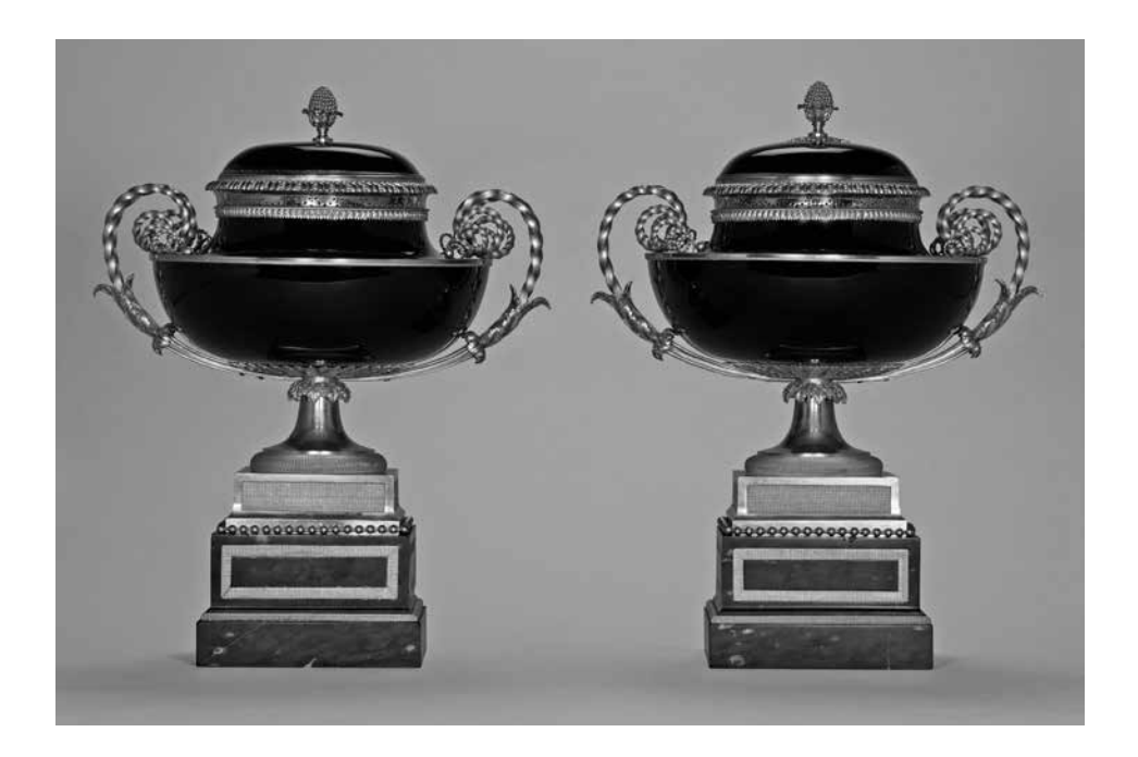
Fig. 3. Pair of lidded bowls ( vases casselottes à monter ), attributed to Pierre-Philippe Thomire, Sèvres Manufactory, France, about 1785 ( coll. J. Paul Getty Museum )

and grisaille cameos after the antique against a beau bleu background, it also incorporated the coat of arms of the Scottish Hope clan, as well as their motto At Spes Infracta (private coll.) , thus revealing the family's insistence on their distinguished noble genealogies (fig. 2).<sup>35</sup> The lot fetched 10,500 francs and was the most expensive service sold. By comparison, a Sèvres service described as 'pâte tendre, décor a bouquets et ruban bleu' made of 118 pieces only fetched 2600 francs.<sup>36</sup> It has been possible to identify two further pieces from Williams Hope's collection: two of the six vases in lots 256 and 257 described as 'a garniture of three vases, plain gro bleu background, fine gilt-bronze mounts, on griotte marble pedestals' are indeed likely the pair of bleu nouveau lidded pot-pourri bowls in the J. Paul Getty Museum with mounts attributed to royal and later imperial bronzier Pierre-Philippe Thomire (1751-1843) (fig. 3).<sup>37</sup>