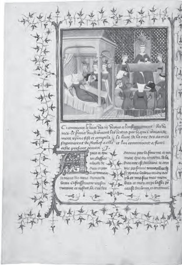
Christine de Pizan and the Three Virtues ( Christine de Pizan, Livre des Trois Vertus, folio 2v, 1405-1406; NAF 25636)

Another woman who is compared to the viragos of Antiquity was Gaita or Sichelgaita of Salerno (1040-1090). She was the wife of the Norman leader Robert Guiscard and is mentioned in Anna Comnena's Alexiad of c. 1148. Anna claims that Gaita frequently accompanied her husband in battle wearing full armour and that she also conducted campaigns by herself, like the siege of Trani in 1080. In 1081, during the battle of Dyrrachium, her men lost courage and fled into the sea but 'Robert's wife Gaita, who used