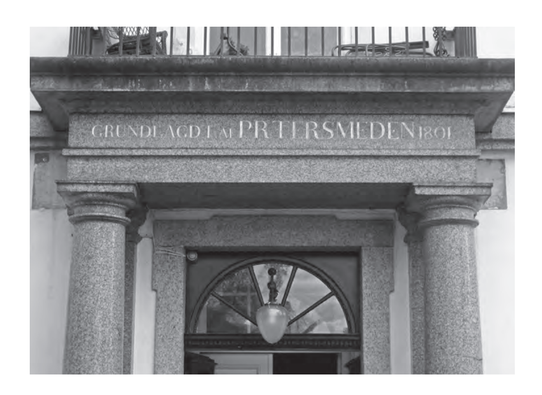
GRUNDLAGDT AF P.R. TERSMEDEN 1801 ('Founded by P.R. Tersmeden in 1801') in gold letters above the entrance to the Tersmeden mansion. The inscription refers not only to the mansion but to the surrounding site as well

sions and their environment can be viewed as symbols.<sup>64</sup> Studying the ironmasters eagerness to build, a picture emerges of everyday life of the people living in the houses and how they shaped and re-shaped their existence. The ironmasters' mansions, with gardens and parks (at this time preferably in an English style), formed an important part of their elite identity.<sup>65</sup> The grand houses were an excellent way to display and illuminate social order and hierarchies.<sup>66</sup>