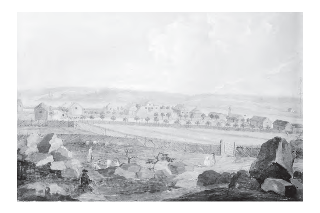
View over Lisjö ironmasters mansion in the parish of Ramnäs, 1773 (oil painting, anonymus; collection Jernkontoret, Stockholm)

ters were new to the place and parish, they belonged to a long line of elite families living in that area.<sup>55</sup>