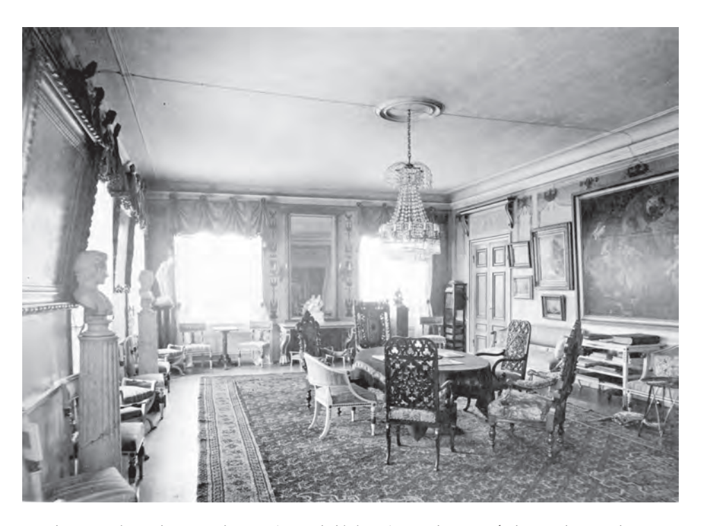
The great salon at the Tersmeden mansion, probably late nineteenth century