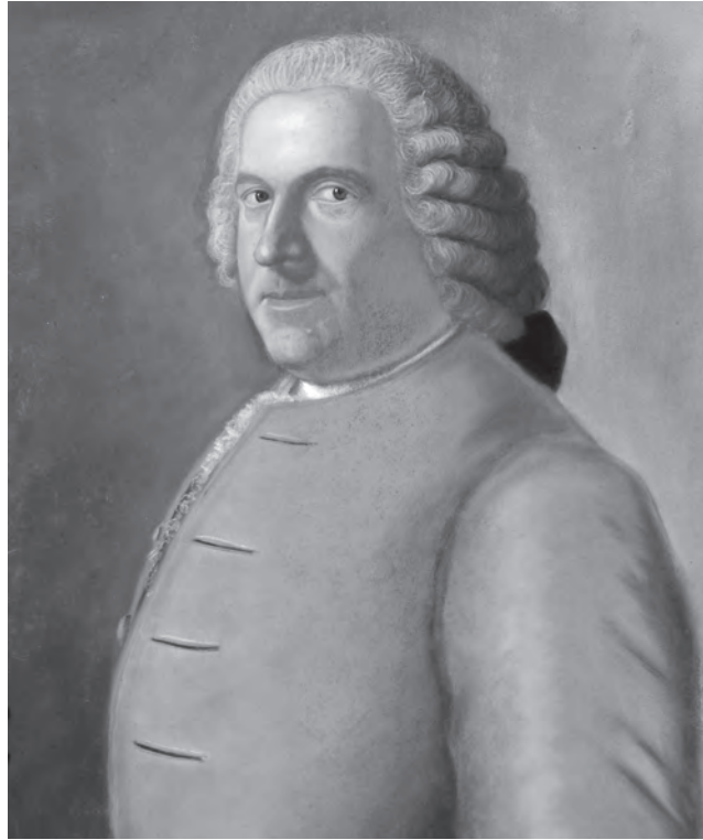
Willem Bentinck (1704-1774) ( painting after a portrait by J.E. Liotard, c. 1750; coll. House Middachten, De Steeg/Rheden )