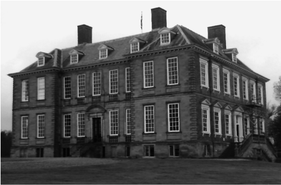
Stanford Hall, Leicestershire, 1697-1704