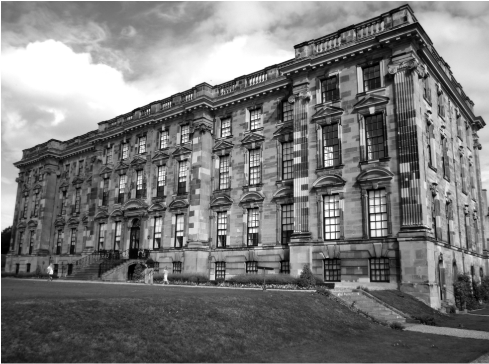
Stoneleigh Abbey, Warwickshire, 1724-1726, designed

production and trade, and the protection and reproduction of status systems'. 13 To these anthropological perspectives we might usefully add cultural definitions of luxury goods which centre on them as 'incarnated signs' carrying broader meanings and associations. Understanding the social and cultural meaning of these signs depends on semiotic virtuosity, whilst consuming luxury in an appropriate manner draws on specialised knowledge. 14 Both of these must be learned by the discerning consumer, sometimes through systems of formal education as Bourdieu argues, but also via cultural institutions such as the Grand Tour and everyday processes of sociability and consumption. 15 In all of these contexts, language was central to the ways in which luxury was understood, communicated and valued by elite consumers.