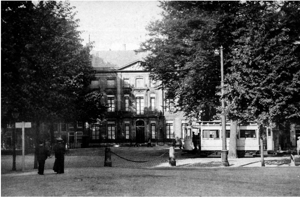
The palace of Princess Emma, mother of Queen Wilhelmina. Lange Voorhout, The Hague, around 1900 (private coll.)

strategy of evocation. Predictably, 'house' (365 occurrences), 'family' (220), 'soul(s)' (215), 'acquaintances' (100), 'money' (100), and 'blood' (75) are among the most frequent terms in the whole novel. Yet it may come as a surprise that 'book(s)' (120 occurrences) is twice as frequent as 'carriage(s)' (60 times). This is of course predicated by the agendas of the two main protagonists: Constance and Addy, who strive to develop themselves through study and move beyond their family backgrounds by expanding their knowledge. The number of appearances of male and female servants is only balanced if coachmen are included in the first category. The relations between upstairs and downstairs remain remarkably underexposed.