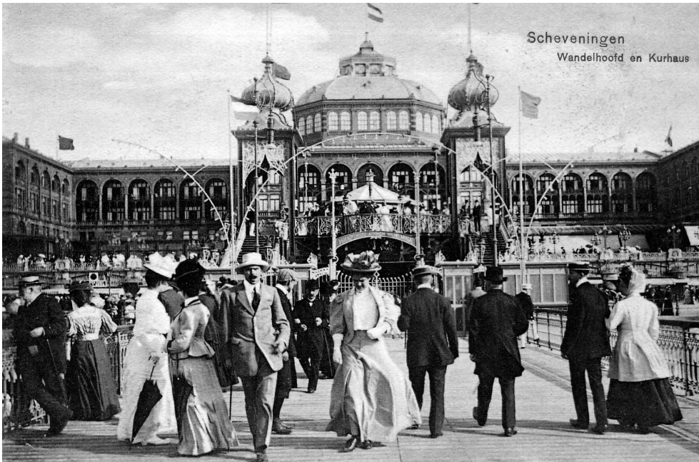
The Kurhaus at Scheveningen, near The Hague, around 1900 (private coll.)