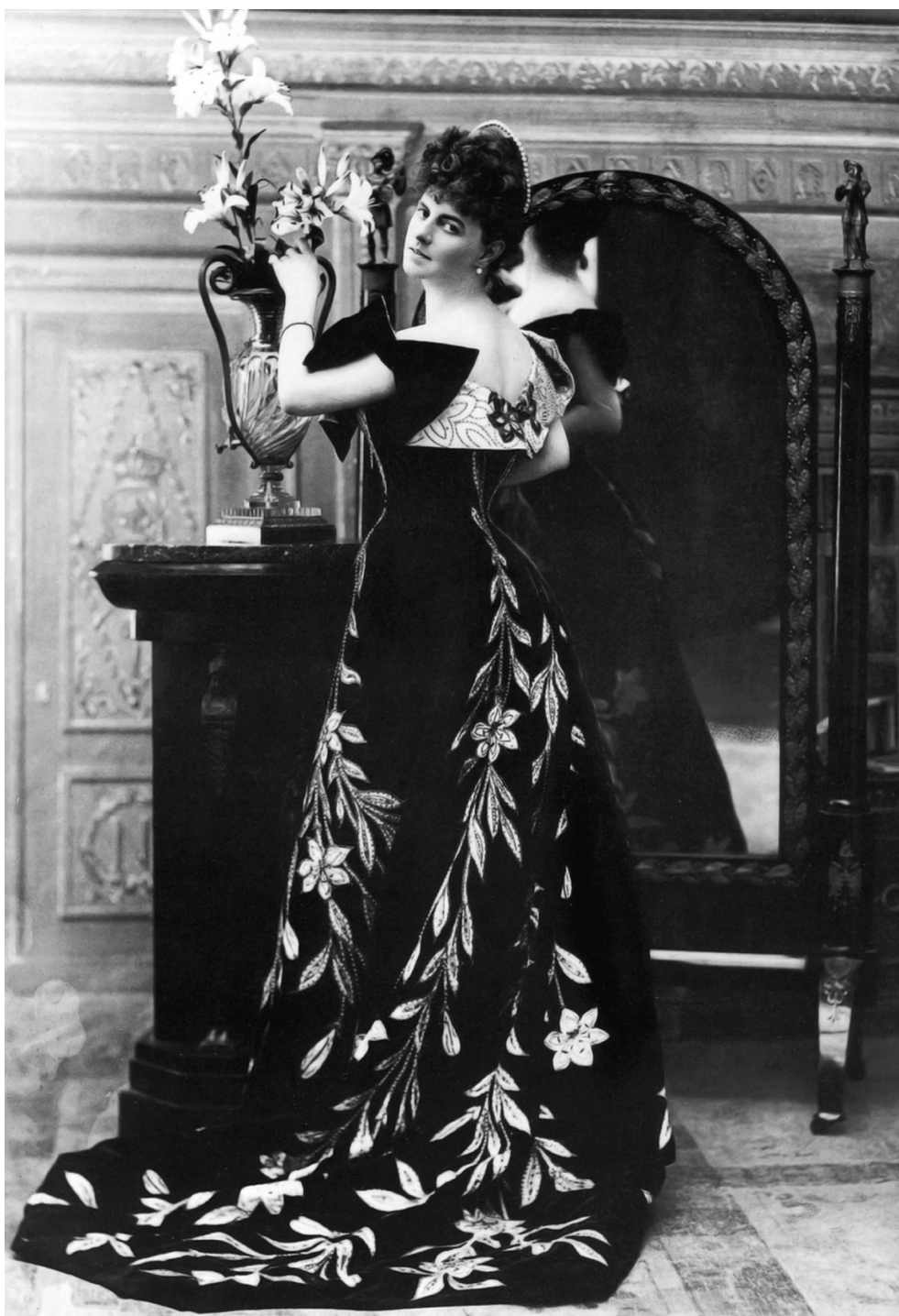
Fact or fiction: Marcel Proust's Duchess of Guermantes? Portrait by Paul Nadar (1896) of Countess Henry Greffuhle, born as Élisabeth de Caraman-Chimay in 1860